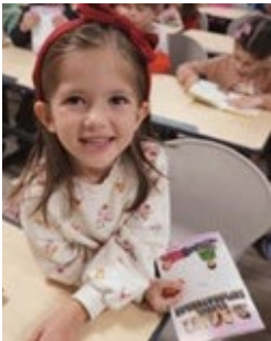
A TMC student poses with her lesson book in a hospital in Romania.

TMC challenges indigenous churches and national leaders to wake up to the spiritual needs of children and youth. It then partners with indigenous volunteers who want to reach children but lack resources to do so. It trains them to